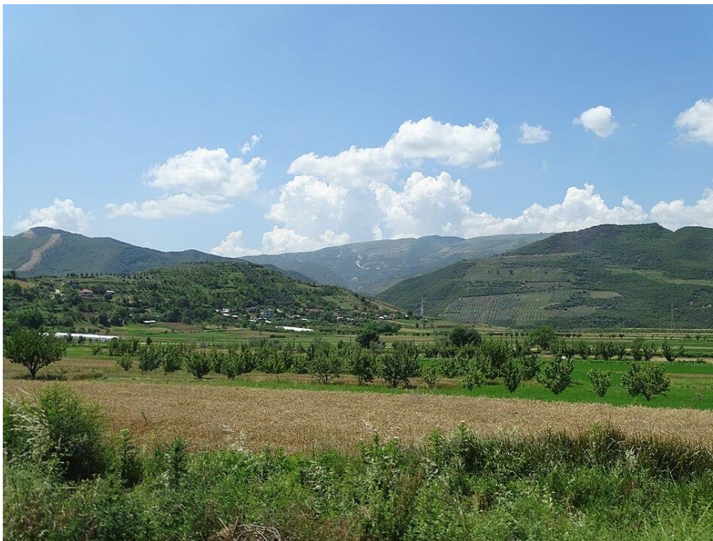
“Scenery from Bus Route from Berat to Çorovoda, Albania

The field trip to Berat will provide CASEE Conference participants with the opportunity to visit one of Albania’s most renowned agricultural regions, with a particular focus on greenhouse production and vineyards. During the visit, participants will gain direct exposure to local farming practices, production systems, and technological applications in horticulture and viticulture. The trip will also showcase the interaction between agricultural activity, rural livelihoods, and the characteristic landscape of Berat, offering valuable insight into the region’s contribution to sustainable agricultural development.